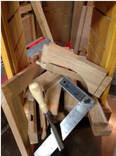
A few of my failures and my sweetheart Stanley chisel