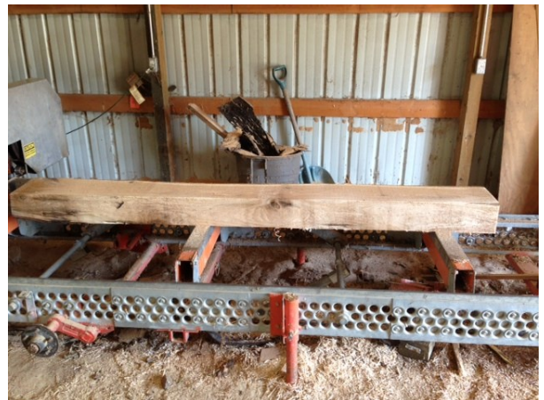
What lies beneath is beautiful butternut lumber