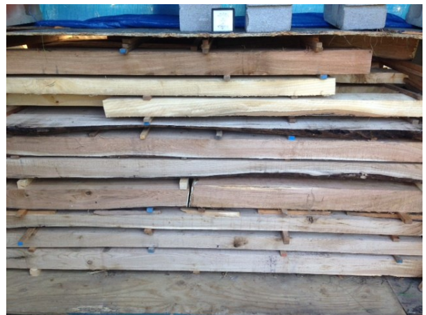
Stacked in the kiln, lots of odd size chunks make stacking a chore. Probably last kiln run for 2013