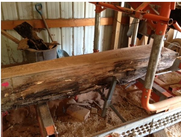
The first cut removes all the rotten sap wood