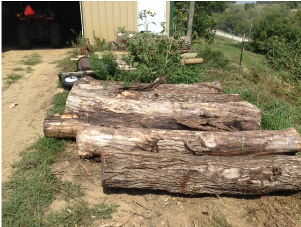
Rough looking Butternut Logs

When the weather turns too hot to work outside, and everyone with an ounce of common sense stays Inside, in the Air Conditioning..... I SAW LOGS, that should tell you something right there !!