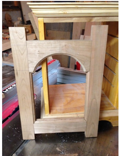
My first success in cherry, you cut the horns after the door is glued up.