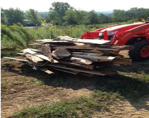
Sawmilling does generate a fair amount of waste