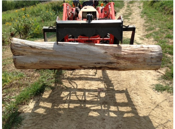
Grapple loader makes life easier