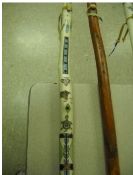
Walking Stick Flutes By Denny Jackson also Ice age bone flutes