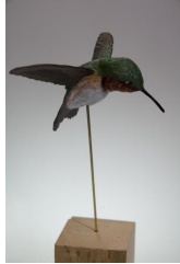
Done By Tom Farr