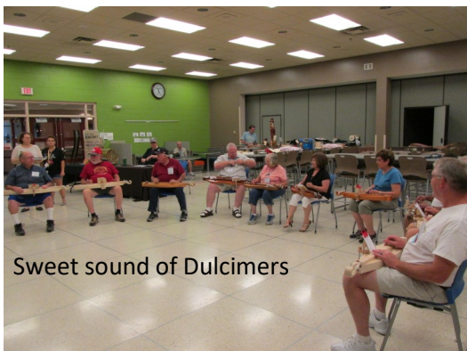
Sweet sound of Dulcimers