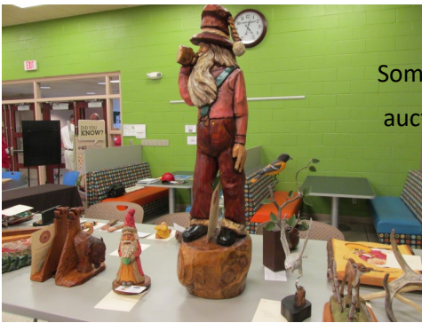
Some of the auction items