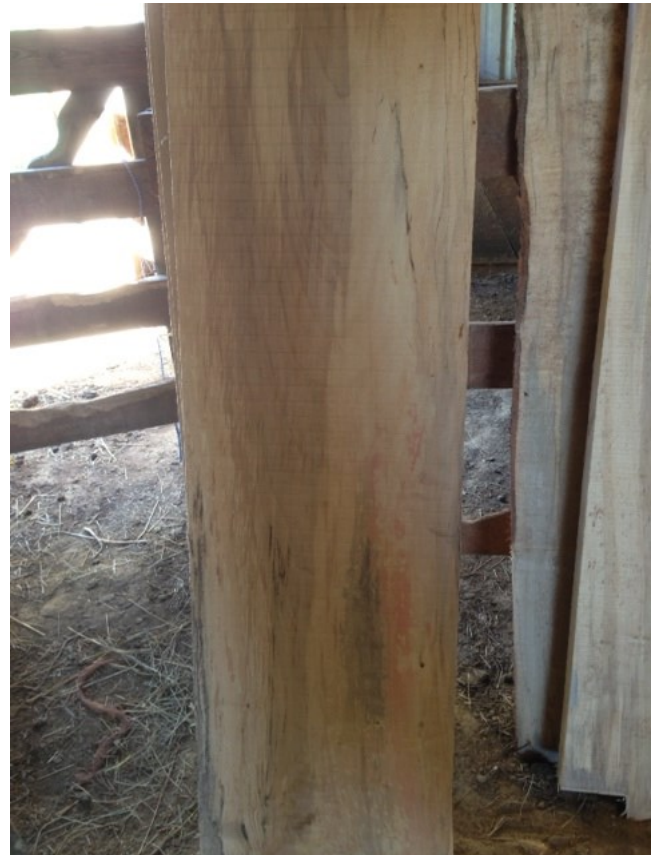
Lots of color in these boards most cut 8/4