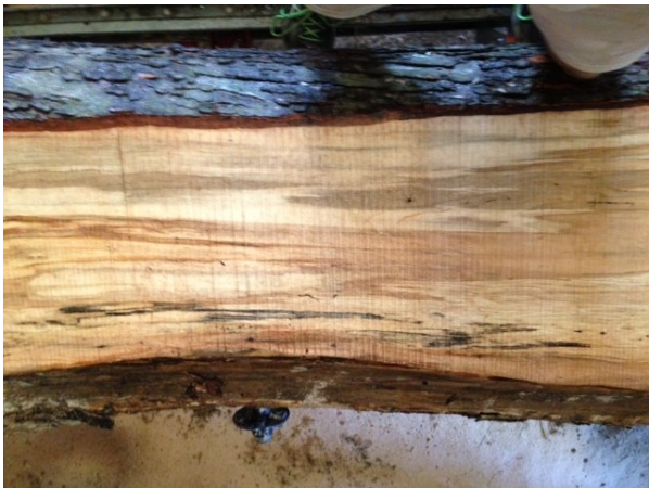
I was hoping the log had spalted