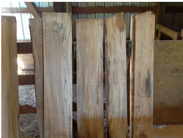
The spalted haul from the log in my kiln drying now

Interesting info on spalted wood can be found here