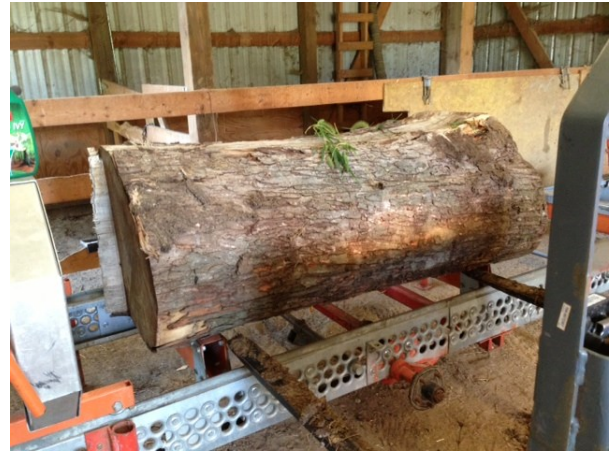
Maple shorty log although it was large diameter