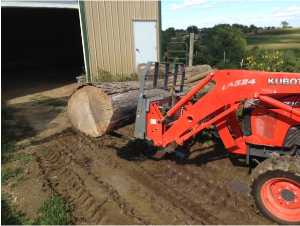
Maple Logs and the backsaver tractor

Still hot outside, and logs to saw, and still at it this time it is a little maple logs.