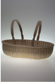
Basket by Sandi Teale