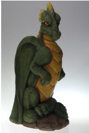
Dragon By Rusty Peterson

Send registrations to: MAWA 2009 FALL SHOW AND SALE PO BOX 521 GRETNA, NE 68028