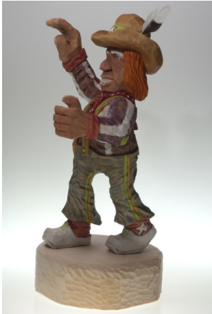
Rodeo Clown By Del Peters