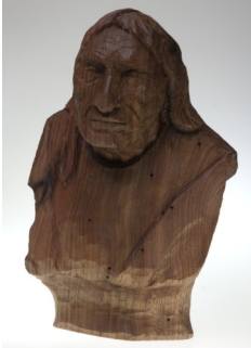
Native American By Mel Ginest

The Carving Tip of the month: by George Bledsoe