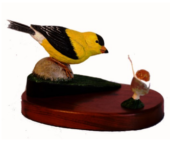
Tom Paskach Best Of Intermediate