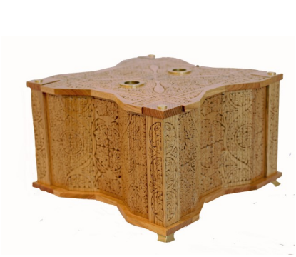
Warren Rauscher Best of Show