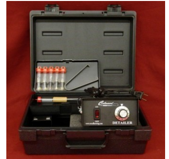
Donated by Colwood