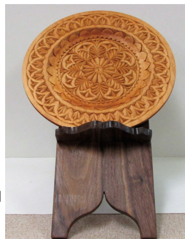
Plate and stand Larry Gruit