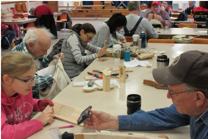
Chip Carving instruction will be available at most meetings with Rich Wagner.