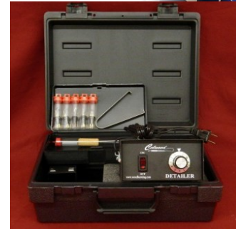
Donated by Colwood