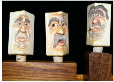
Sorry, I don't know the carver.