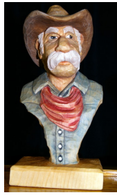
Cowboy busts by Corey Hallagan