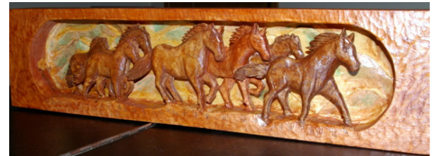
Horses - Deep Relief carved by Joe Schock