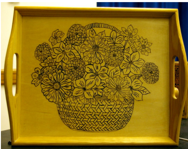
Tray carved by Rich Wagner