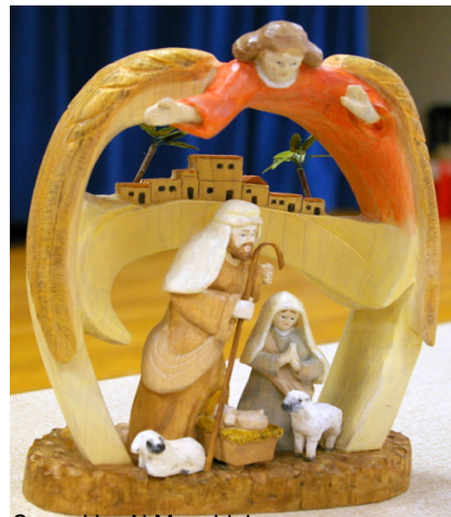
Carved by Al Menghini