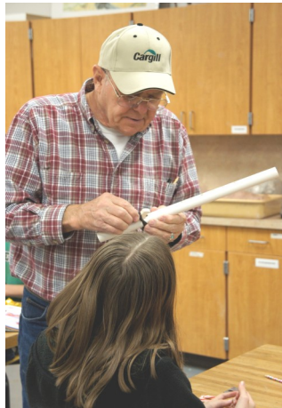
Rich helping a student