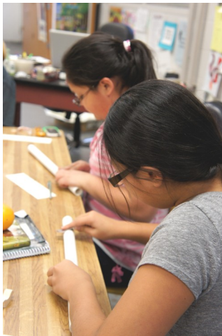
The satisfaction of making something with your own hands.