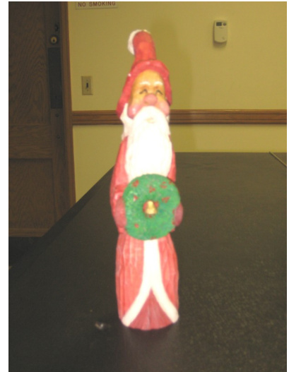
Santa with wreath by Don Elsasser