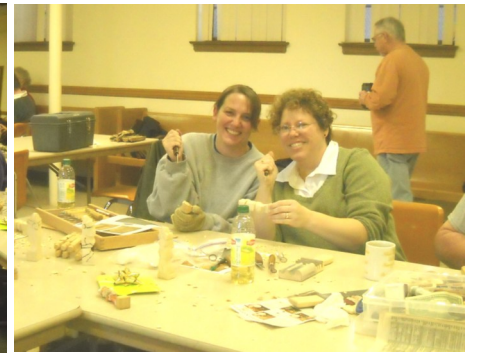
Play Misty for me MAWA style.....