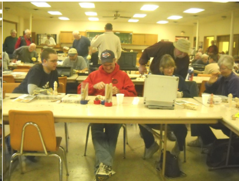
Proximity is not necessarily acceptance. - Nice looking sweatshirt -