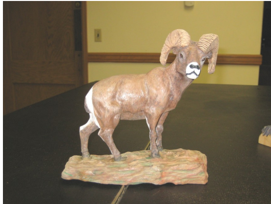
Big Horn Sheep