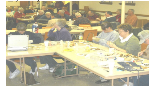
Busy staying on task?