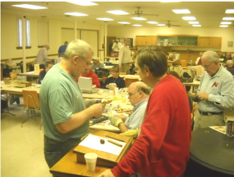
PJ helping a student.