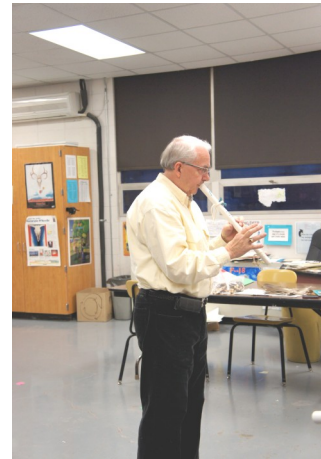
The Pied Piper in action