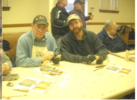
These guys look serious, don't they?