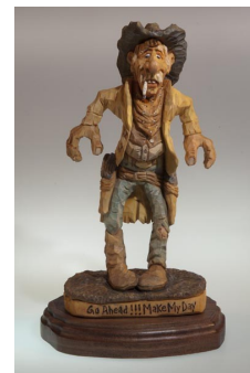
Carved by PJ Driscoll