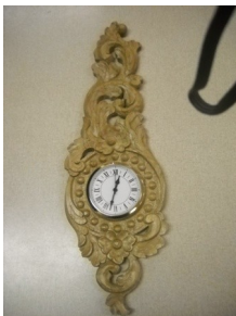
Carved Clock By Al Menghini