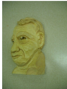
3/4 face by George Bledsoe

Club tool selection. More tools on the way