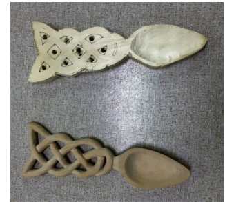
Cut out and finished spoon