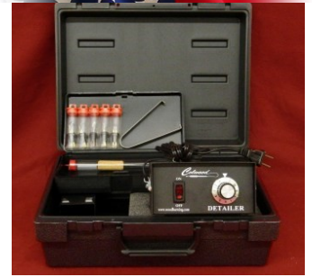
Donated by Colwood